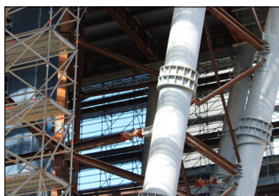
New structures & authority projects