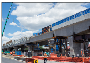
Civil infrastructure - road, rail & tunnel projects